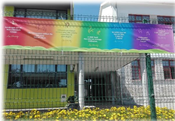
Escola Básica n.º 1 de São Bernardo