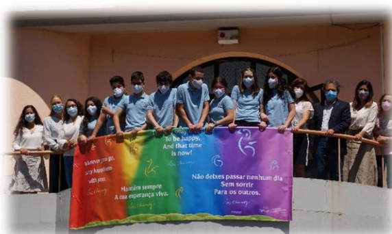
Escola Básica dos 2.º e 3.º Ciclos D. António Ferreira Gomes