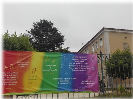
Escola Secundária José Estêvão