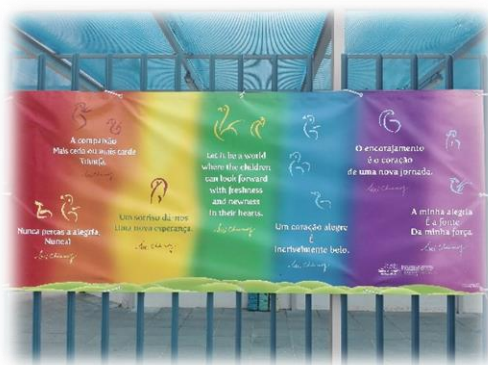
Escola Básica n.º 2 de São Bernardo (1.º Ciclo / 2.º e 3.º Ciclos)