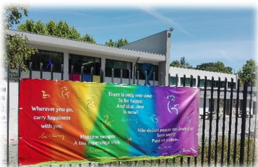
Escola Secundária de Ermesinde

The Portuguese schools made its own selection from 27 aphorisms, which were printed on Happiness-Banners that the schools wanted to post so that the whole community could read and feel inspired: